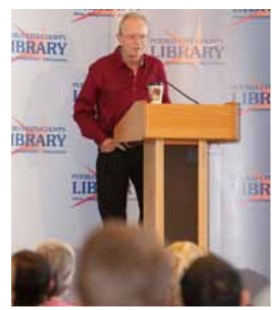
Author Kent Haruf in Pueblo.

Total attendance for this year's Booklovers Blacktie Ball was 208, up from last year's attendance of 184. With ticket sales and sponsorships, the total donated to the Pueblo Library Foundation was $19,620. This is a 37% increase from last year's event. An expanded silent auction and a continuation of the Friends of the Library sponsorship for students to attend were the main reasons for the increase.