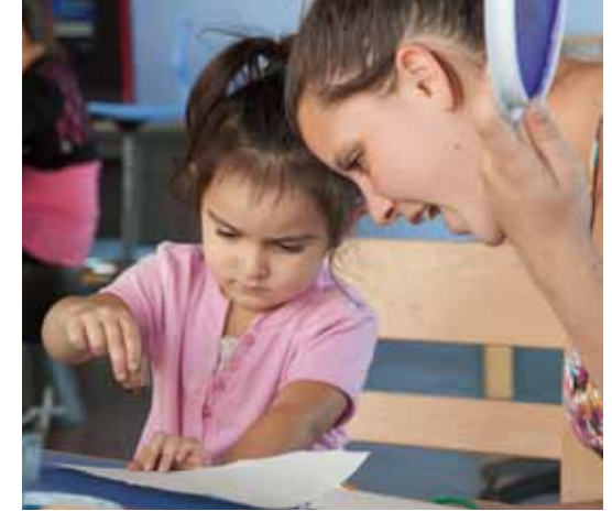
Kids craft in youth services.