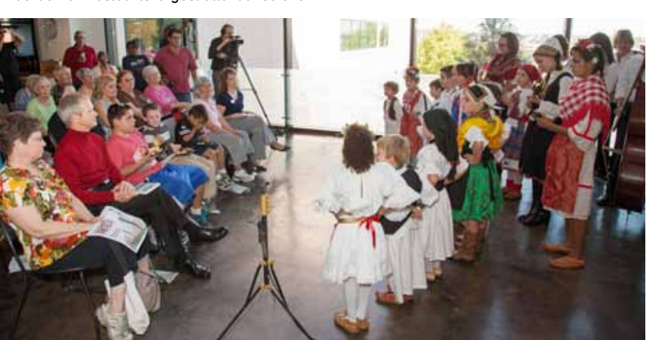
Okolitza Tamburitzans perform at the All Pueblo Reads Kickoff Extravaganza.