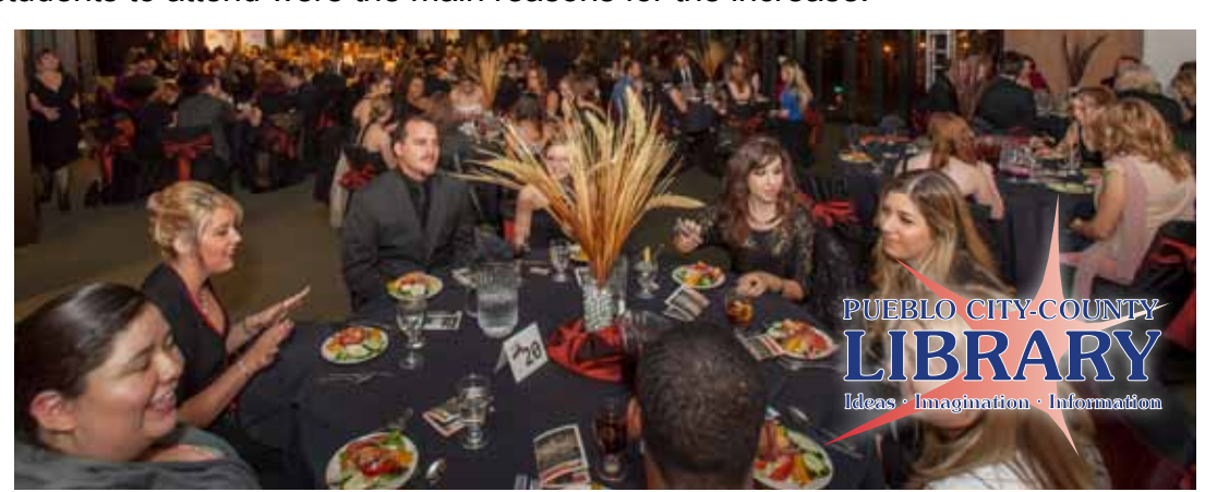
2012 Booklovers Blacktie Ball hosted its largest attendance ever.